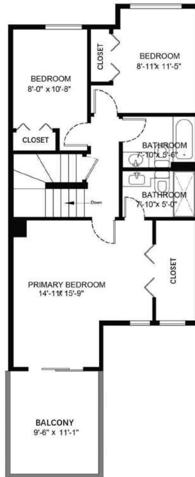
UPPER FLOOR PLAN Ceiling Height: 8'-0"